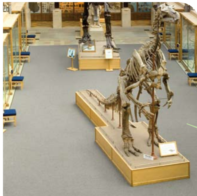
The Museum's central court is dominated by two dinosaur skeletons.