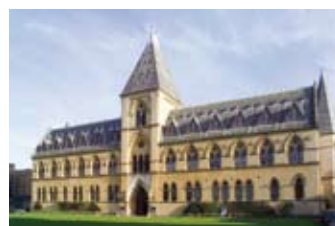
Oxford University Museum of Natural History