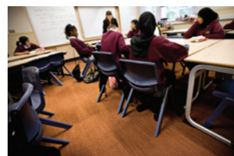
Levenshulme Girls High School Levenshulme

Gradus' Kata and Jaku carpet tiles were fitted in two classrooms at Levenshulme High School for Girls. Kata was installed in colourway 'Yama' and Jaku was installed in colourway 'Shika' to create a modern yet welcoming learning environment. Jaku and Kata carpet tiles can be installed randomly, quarter turn or monolithically offering the opportunity to create interesting design alternatives to traditional broadloom designs. Because there is no set layout, random installation is quick and easy, thereby saving time and reducing wastage. The tiles have a strong flammability rating and have been tested to Class Bfl-S1.