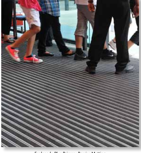
Esplanade Plus Primary Barrier Matting

Boulevard 5000HD in Jackdaw was chosen as the wiper. The high performance barrier carpet incorporates a light scraper for dirt removal and uses a heathered design to disguise soiling. Gradus Matting Systems are easy to maintain and can help to reduce maintenance costs throughout the building.