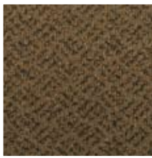
Freeway (Old Stone)