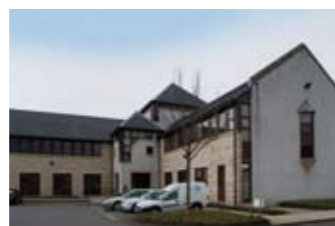
Scottish Environment Protection Agency Stirling