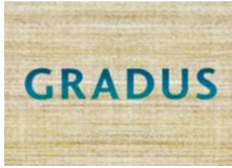
printed with a logo