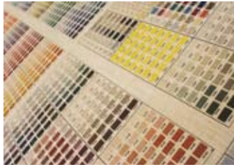
1900 colour variations